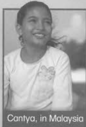
Cantya, in Malaysia

This is my garden. We have many plants. I have to work in the garden every day. I like to work in the dirt. I also like to paint pictures of the fruit and flowers.